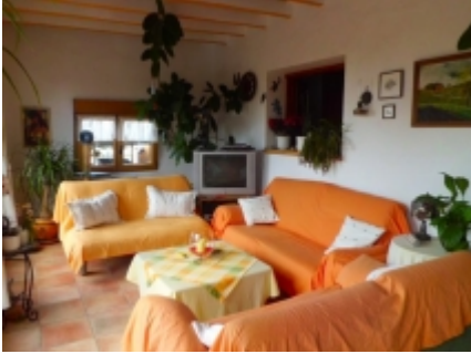
Naya/second living area