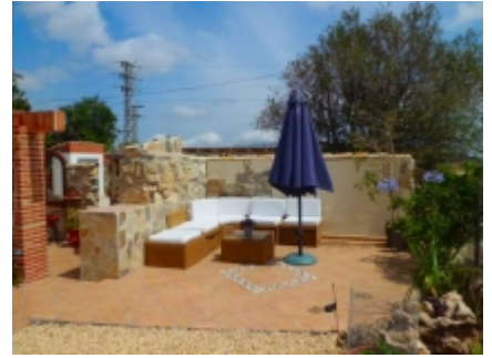
Adjacent chill area!