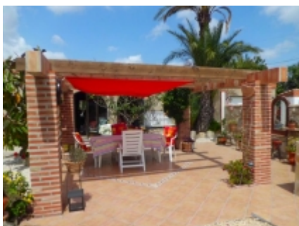
Central terrace/outdoor dining

4 bedrooms, 2 bathrooms, 2 living rooms, dining area, 2 nayas, kitchen. Garage, car port, SEA & MOUNTAIN VIEWS. Fenced & gated plot. Central terraced area with built in BBQ & views!! Gas ch.