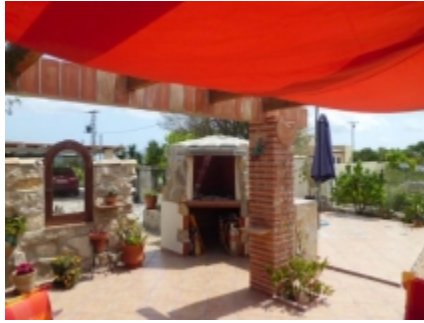
Built in BBQ