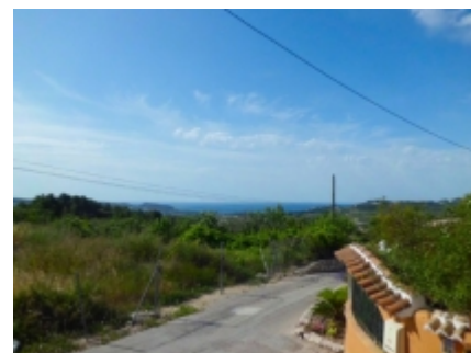
Distant views to sea