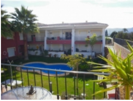
View to pool from naya!