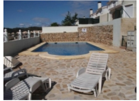
East side community pool