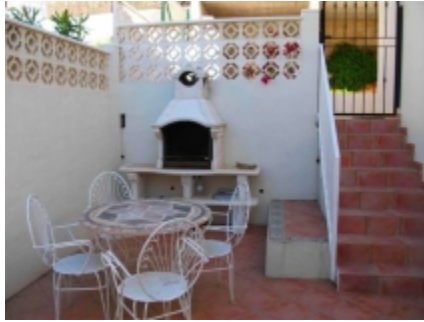
BBQ & courtyard