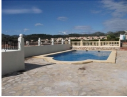
West side community pool