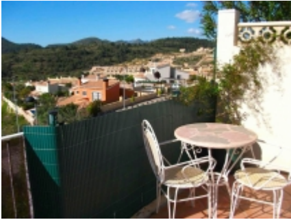
Open naya terraces