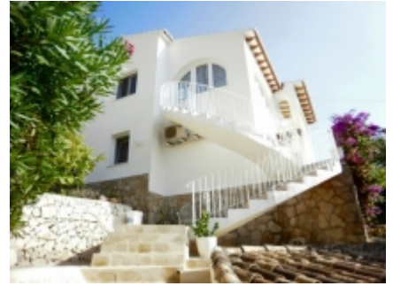
Entering from the road