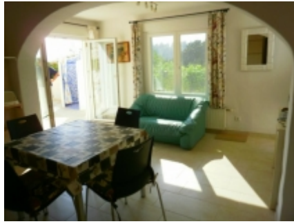
Living area & dining

CALIFICACIÓN ENERGÉTICA GLOBAL EMISIONES DE DIÓXIDO DE CARBONO [kgCO 2 /m 2 año]