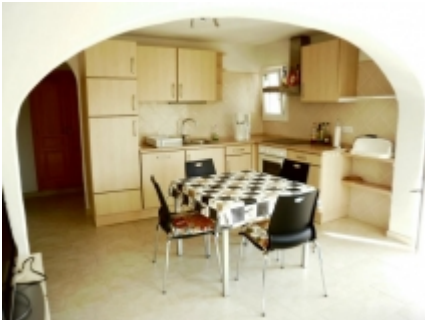
Ground floor dining/kitchen