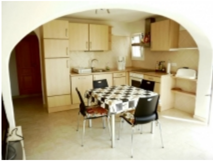
Ground floor dining/kitchen