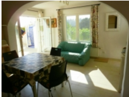
Living area & dining

CALIFICACIÓN ENERGÉTICA GLOBAL EMISIONES DE DIÓXIDO DE CARBONO [kgCO 2 /m 2 año]