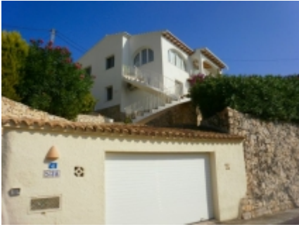
House & garage below