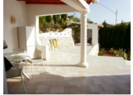
Summer kitchen to mirador