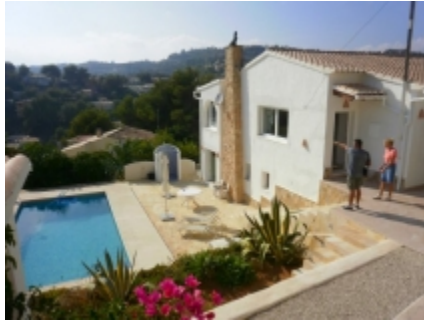
East side of house + pool