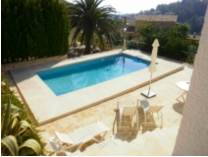
Pool from above