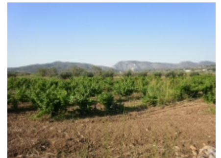
Looking south west