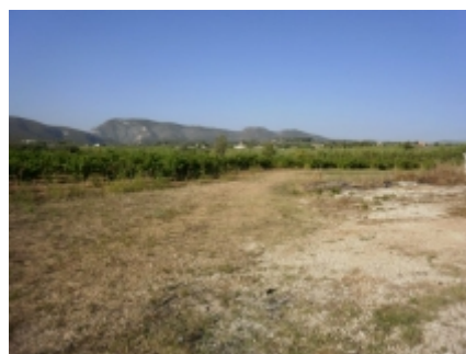
Sout west again