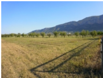
Looking north west

Flat land. Olive trees established. Agricultural water.