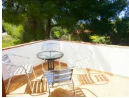
Terrace off master

CALIFICACIÓN ENERGÉTICA GLOBAL EMISIONES DE DÍOXIDO DE CARBONO [kgCO 2 /m 2 año]