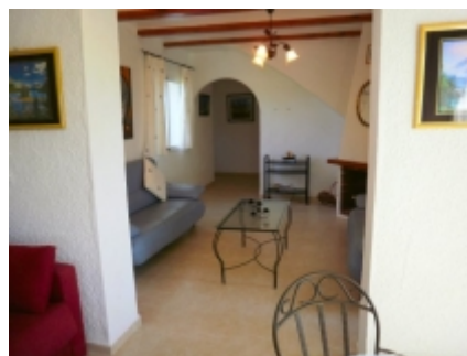
From dining to living