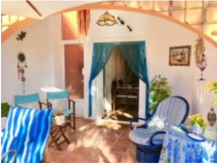
Looking into naya