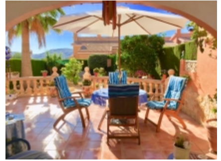
Looking from naya