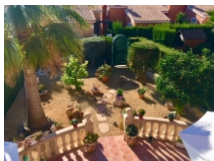
Gardens from above