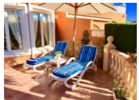
Terraced area for chilling!