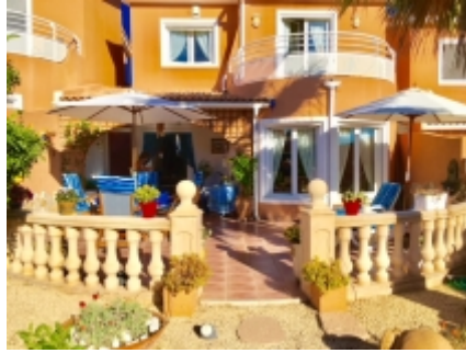
Gardens from above