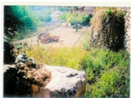
Rear garden (to fence)

Village town house in need of total renovation. Small private garden/patio to rear of property. Accommodation on two floors, good wooden beams can be re-used. Quiet area. Cul-de-sac.