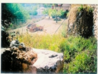
Rear garden (to fence)

Village town house in need of total renovation. Small private garden/patio to rear of property. Accommodation on two floors, good wooden beams can be re-used. Quiet area. Cul-de-sac.