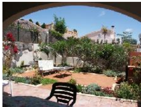
From naya to gardens