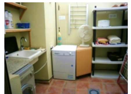
Roofed utility room