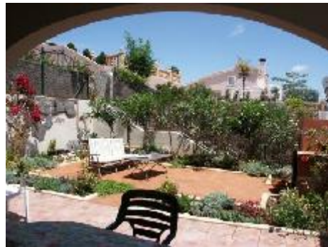
From naya to gardens