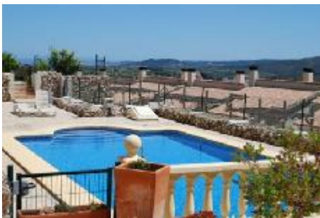
One of 2 community pools

There are three bedrooms, guest shower room, master bathroom, terrace off master bedroom (tv!), huge living/dining, separate kitchen, naya off the dining area leading to patio gardens bordered by flower beds. Fenced, private. Two community pools. Off the road location so very quiet! Allocated parking. Pedreguer 3km. Gata de Gorgos 2km. Airports approx 90 km away. Ceiling fans. Pre-installation for air con.