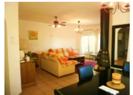
Large living area with fireplace