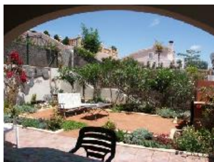
From naya to gardens