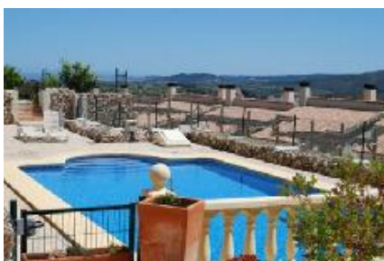
One of 2 community pools

There are three bedrooms, guest shower room, master bathroom, terrace off master bedroom (tv!), huge living/dining, separate kitchen, naya off the dining area leading to patio gardens bordered by flower beds. Fenced, private. Two community pools. Off the road location so very quiet! Allocated parking. Pedreguer 3km. Gata de Gorgos 2km. Airports approx 90 km away. Ceiling fans. Pre-installation for air con.