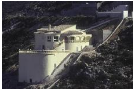
The house again