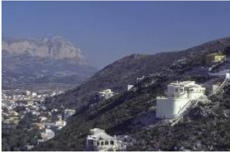
Views to Montgo