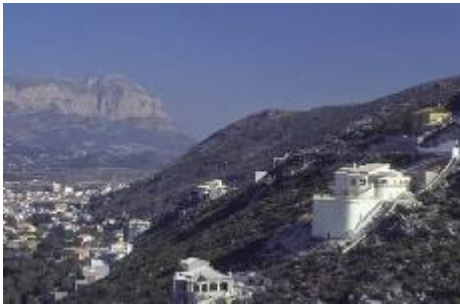
Views to Montgo