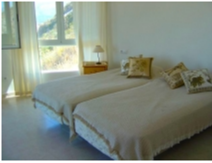
Guest bedroom 2