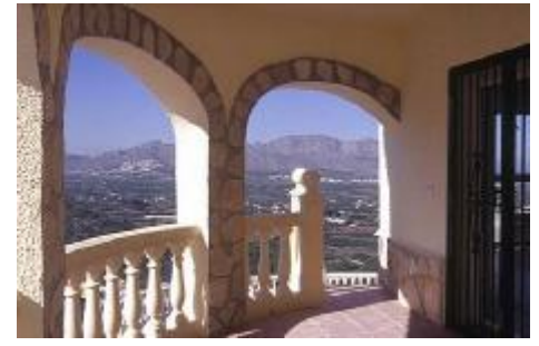
Naya with views