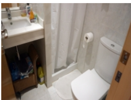
Ensuite shower room