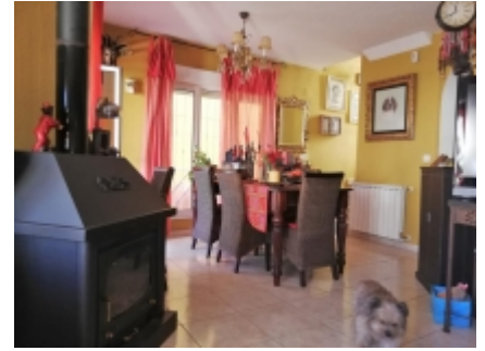
Living to dining area