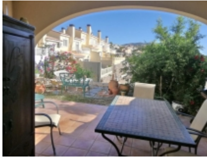
Naya & front garden