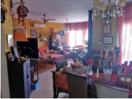
Dining to living area