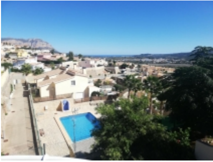
Views & community pool