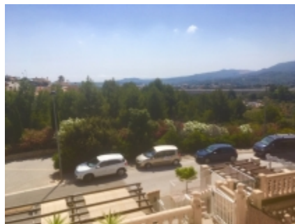
From upper terrace