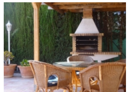
BBQ & naya