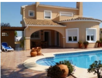
During the day!

4 bedrooms, 3 bathrooms, guest wc. Huge living/dining room with woodburner, kitchen, utility room, naya extended in wood with built in BBQ. 8x4 pool, big terraced areas, off road parking, gardens laid to gravel & shrubs. Furnished. Air con, gas ch, internet, UK tv.