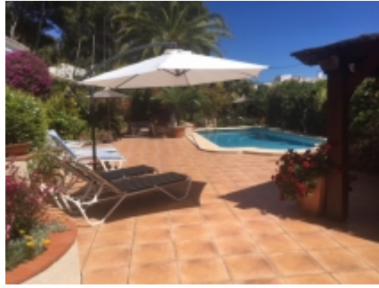
Open terraces & pool