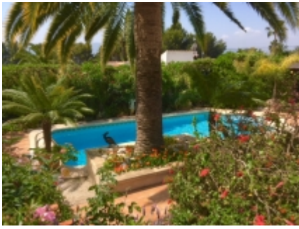
Pool from gardens