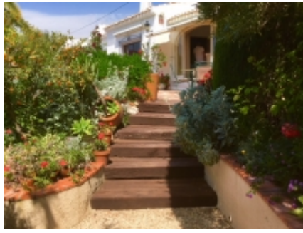
Wooden entrance steps