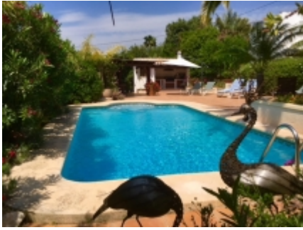
Pool & summer kitchen