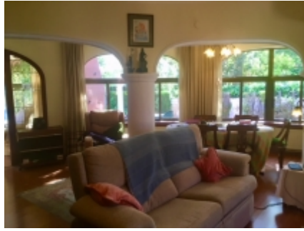
Large living room

CALIFICACIÓN ENERGÉTICA GLOBAL EMISIONES DE DÍOXIDO DE CARBONO [kgCO 2 /m 2 año]