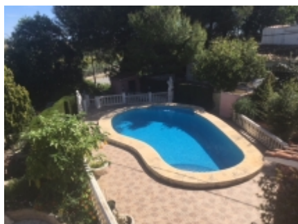
Pool from upstairs

3 bedrooms, 2 bathrooms, huge living areas, naya, pool, orchards, herbaceous borders. Garage, car port. Double entry gates. BBQ, outdoor sitting areas, summer house. Walled private grounds.