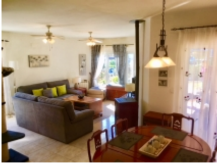
Dining to living area