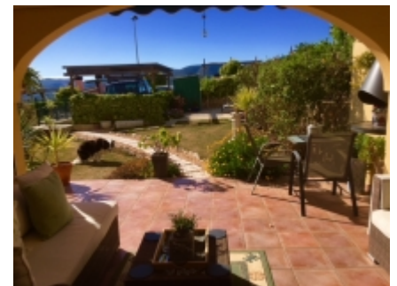
Naya looking out