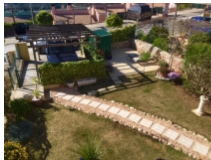
Garden taken from upstairs