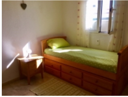
Guest bedroom 1

CALIFICACIÓN ENERGÉTICA GLOBAL EMISIONES DE DÍOXIDO DE CARBONO [kgCO 2 /m 2 año]