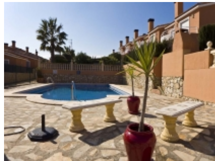
Community pool & terraces