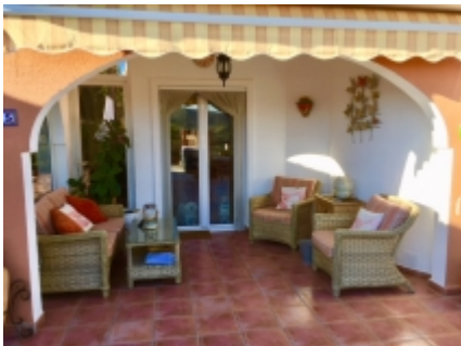
Naya with awning

3 bedrooms, two shower rooms. Living/dining room, partially glazed naya with awning, kitchen, roofed utility with built in units. Large landscaped gardens, sea views, car port. Gated private plot.