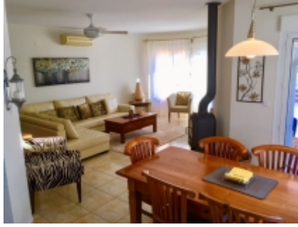
Dining to living room