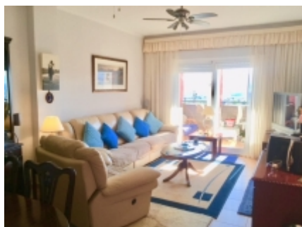
Dining to living area