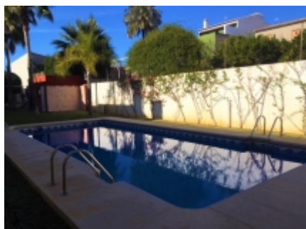
Community pool & gardens

Three bedrooms, shower room, bathroom, living/dining room, naya, large kitchen, entrance hall. Open terrace off master suite. Extra store room. Ducted ac hot/cold throughout. Feature fireplace in living room (elec). Underground parking & store. Community gardens & pool. Playground. Gated secure complex.