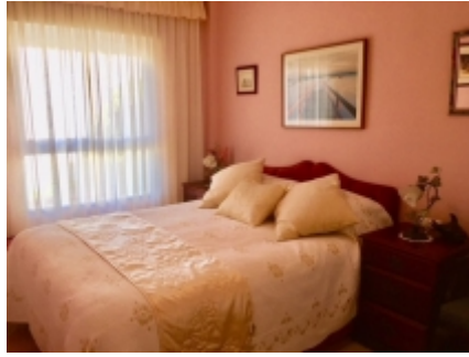
Guest bedroom 2

CALIFICACIÓN ENERGÉTICA GLOBAL EMISIONES DE DÍOXIDO DE CARBONO [kgCO 2 /m 2 año]