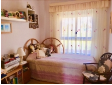
Guest bedroom 1