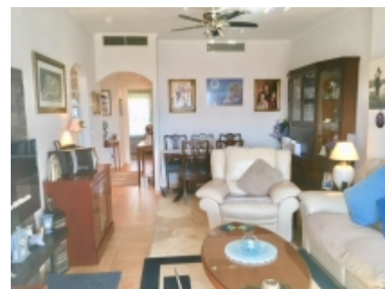
Living to dining!