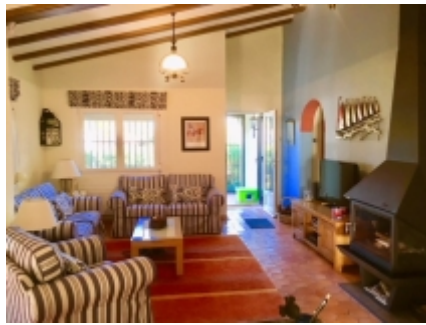
And again with woodburner

CALIFICACIÓN ENERGÉTICA GLOBAL EMISIONES DE DIÓXIDO DE CARBONO [kgCO 2 /m 2 año]