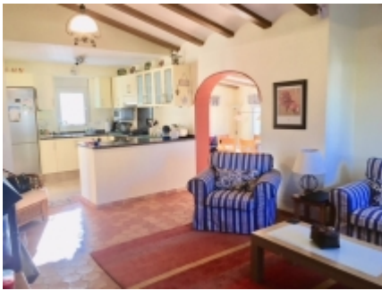
Large living area