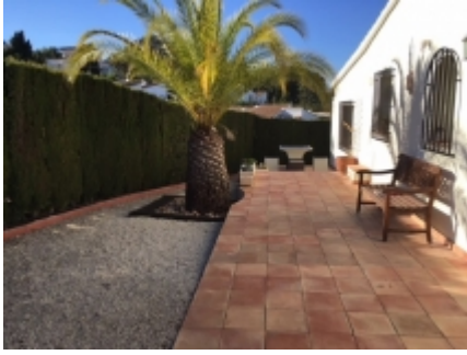
South facing terrace & garden