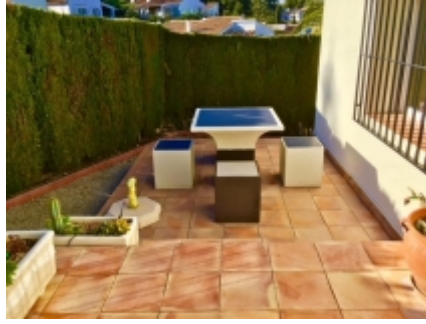
Al fresco dining!