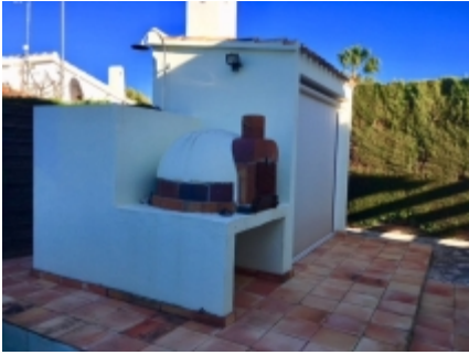
South facing terrace & garden