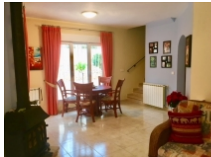
Living to dining!!