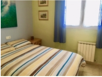
Guest bedroom 2