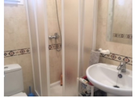
Guest shower room