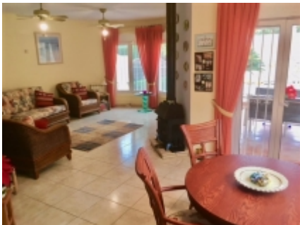
Dining to living area

Large gardens with pergola, double car port, naya, 3 bedrooms, 2 bathrooms, living/dining room, kitchen, utility, community pool.