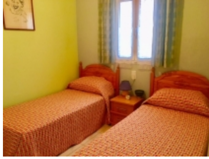
Guest bedroom 1