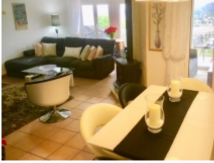
Dining t living with woodburner