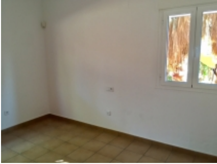
Guest bedroom 1