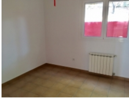
Guest bedroom 2

CALIFICACIÓN ENERGÉTICA GLOBAL EMISIONES DE DIÓXIDO DE CARBONO [kgCO 2 /m 2 año]