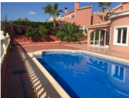
Pool & terraces

3 bedrooms, 2 bathrooms, wc. Living/dining, kitchen, utility. Glazed naya. Open terraces, 8x4 pool, steps down from off road car port.