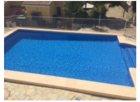
Pool from upstairs