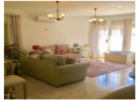
Huge living room