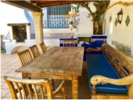
Exterior dining poolside