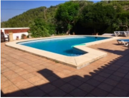
Pool & terraces