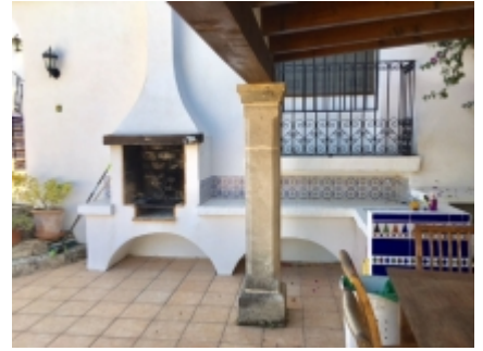
Built in BBQ