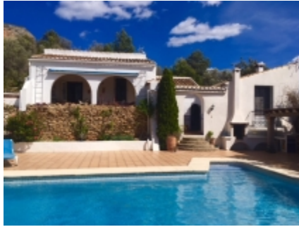
Pool & finca!