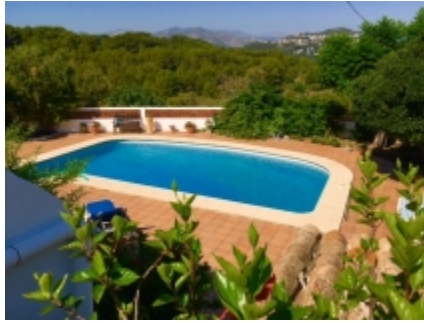
Pool from above