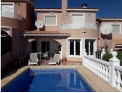
Villa & pool again