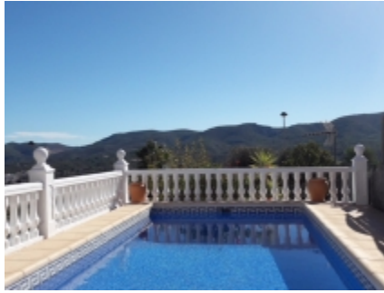
Pool & views