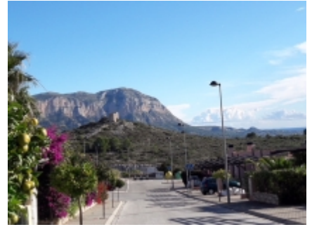
View to Montgo from parking!