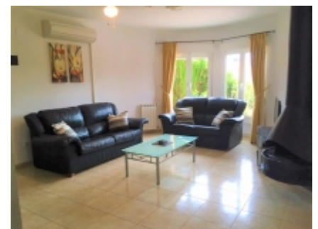
Huge living room