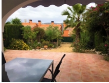
Naya, terrace & gardens