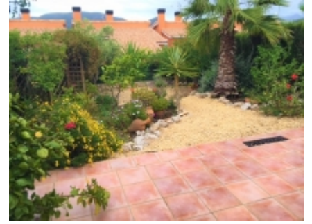
Terrace & gardens