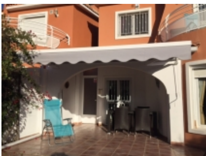
Naya with awning

Three bedrooms, shower room, bathroom. Naya, kitchen, utility, large living/dining room, open terraces, awning. Car port, small garden. Very good property.