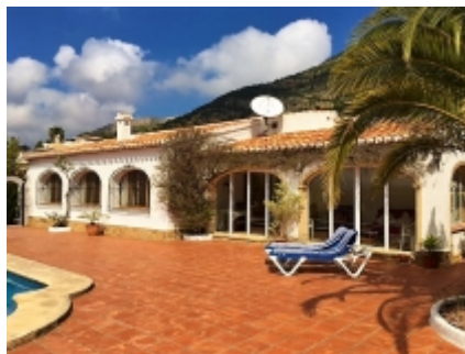
This lovely villa