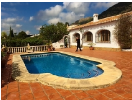
The pool & villa

House on one level. Almost flat plot. Total privacy. Gated driveway leading to "turn around" & garage. Gardens laid to pathways & shrubs. Courtyard, store shed. 10x5 pool with large open terraces. 3 bedrooms, 2 bathrooms, living/dining room, kitchen, utility, glazed naya. Ga ch. Double glazing.