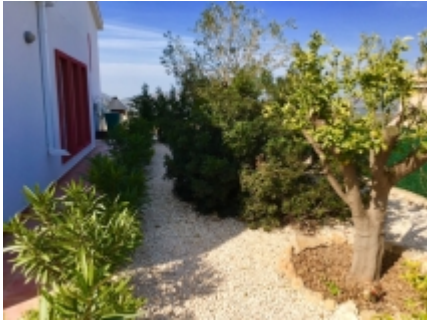
Easterly side gardens