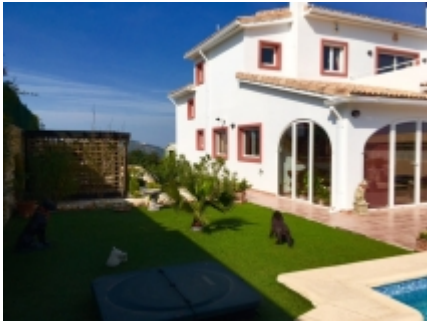
Westerly side gardens