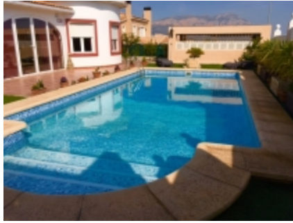
Views to the north