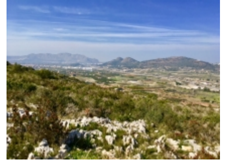
Views to the east