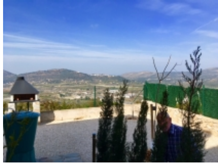
Views to the north