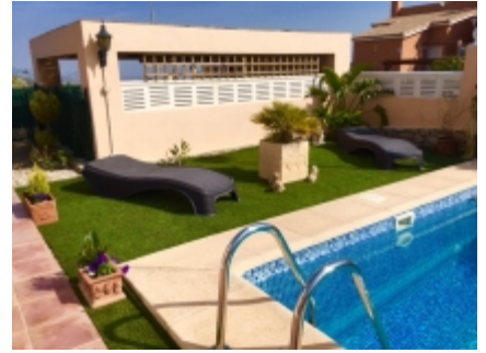
Views to the east