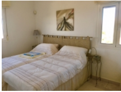
Guest bedroom 1

CALIFICACIÓN ENERGÉTICA GLOBAL EMISIONES DE DIÓXIDO DE CARBONO [kgCO 2 /m 2 año]