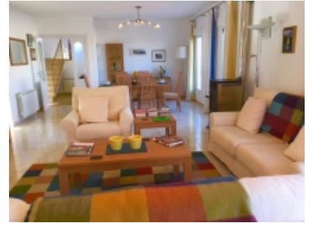
Living to dining areas