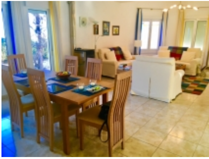
Dining to living room