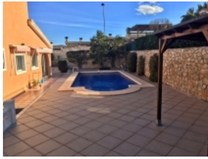
Pool + terraces