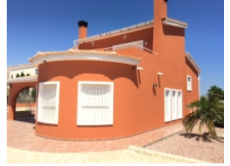
Newly painted villa!