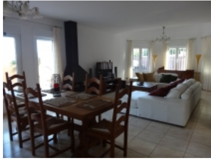
Dining to living areas