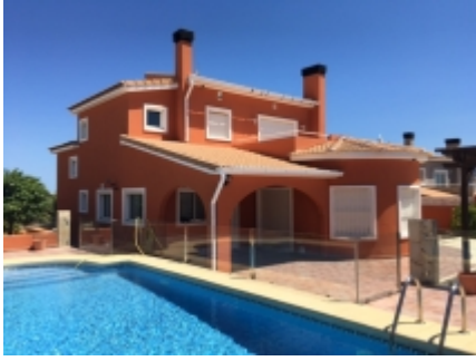
House in the sun!!