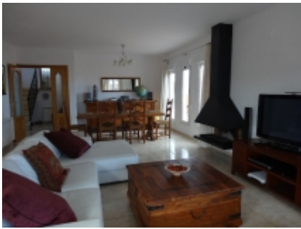
Living to dining area