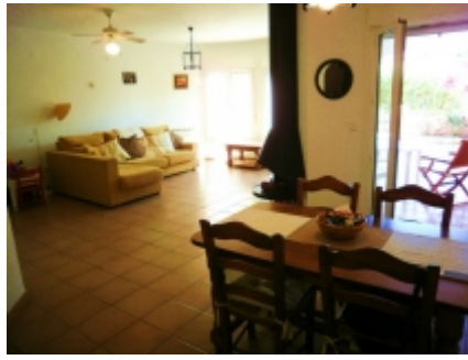
Dining to living areas