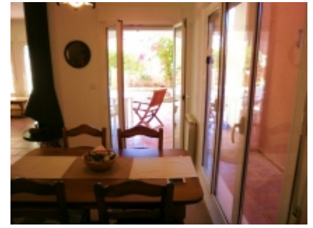
Dining to naya