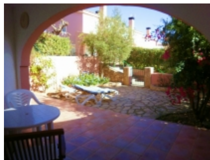
Naya & gardens