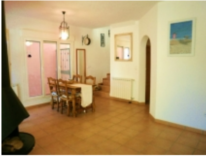
Living to dining area