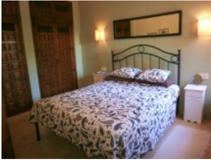
Guest bedroom 3