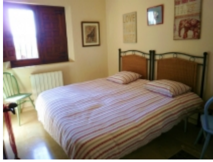
Guest bedroom 1