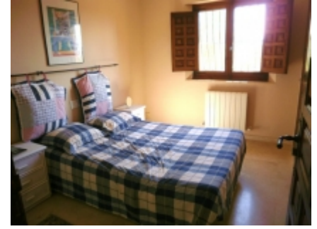
Guest bedroom 2