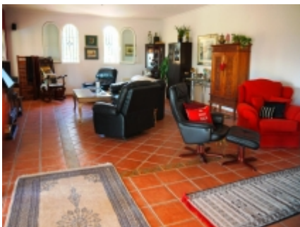
Huge living room

5 bedrooms, 3 bathrooms, wc. Huge living area, luxury kitchen, utility, dining area. Enormous naya, jacuzzi, 10x5 pool. Lovely gardens. Summer kitchen. Massive driveway, double entry gates. Gas ch. Valley views.