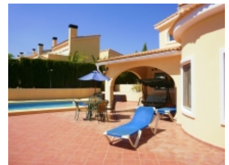
Naya & terraces