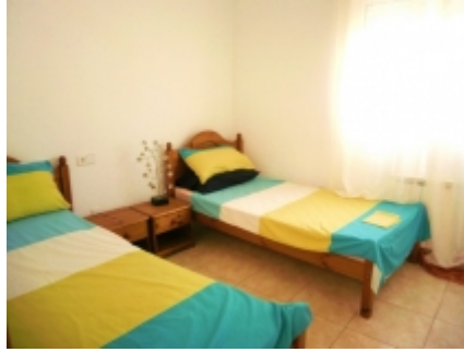
Guest bedroom 2