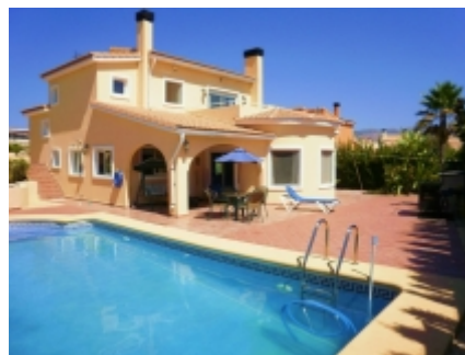
Pool, villa & open terraces