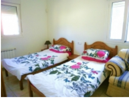
Guest bedroom 1