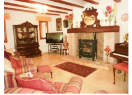
Main living room