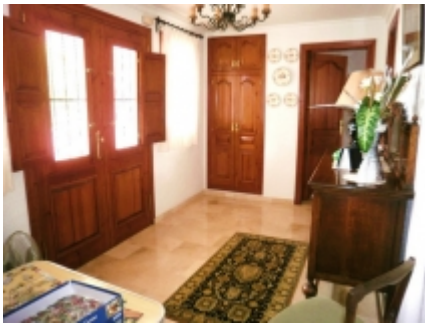
Main entrance hall