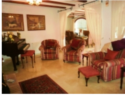
Living area again