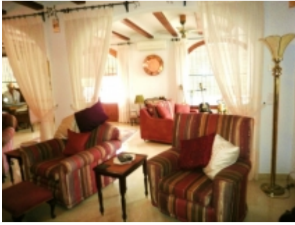
Sitting area by dining