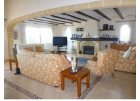
Huge living room