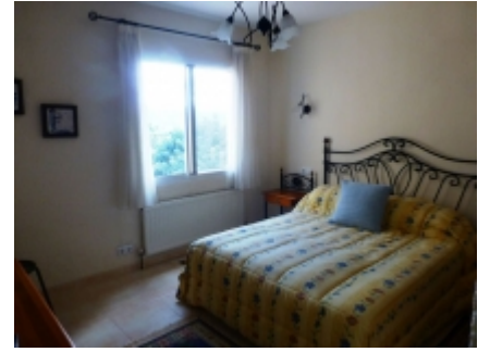
Guest bedroom 1