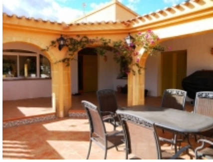
Naya & open terraces