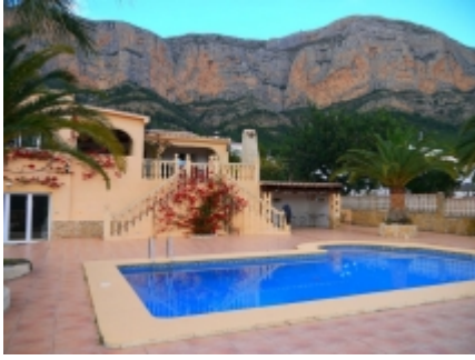
Montgo, villa & pool!