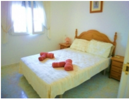
Double bedroom upstairs