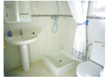
Guest shower room