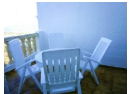
Terrace off living room