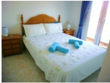
Guest bedroom downstairs

CALIFICACIÓN ENERGÉTICA GLOBAL EMISIONES DE DÍOXIDO DE CARBONO [kgCO 2 /m 2 año]