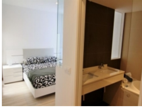
Bedroom with ensuite bathroom