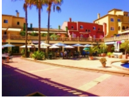
La Plaza again