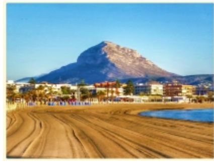
Montgo & beach!

CALIFICACIÓN ENERGÉTICA GLOBAL EMISIONES DE DÍOXIDO DE CARBONO [kgCO 2 /m 2 año]