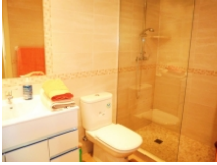
Large new shower room