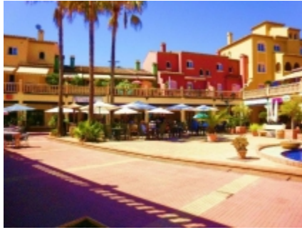
La Plaza again