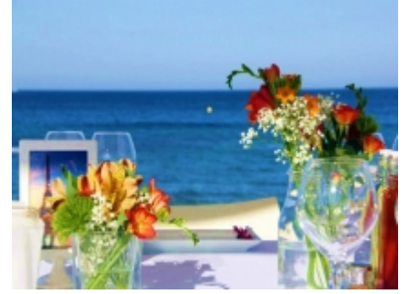
chill at La Siesta!