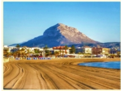
Montgo & beach!

CALIFICACIÓN ENERGÉTICA GLOBAL EMISIONES DE DIÓXIDO DE CARBONO [kgCO 2 /m 2 año]