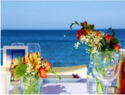
Chill at La Siesta