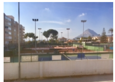
View to tennis courts