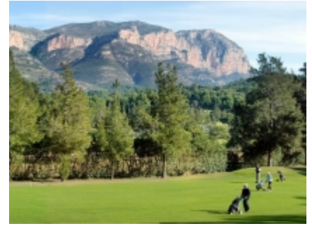
La Sella Golf Course