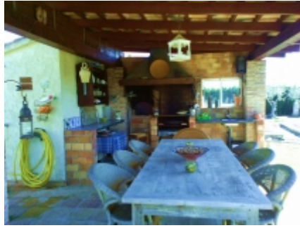
Poolside summer kitchen/dining