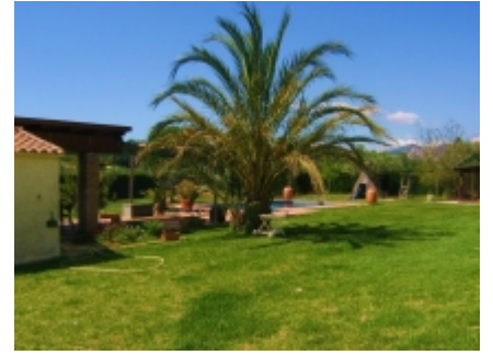
Lawns around pool