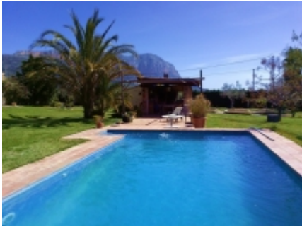
8x4 pool & summer kitchen/dining