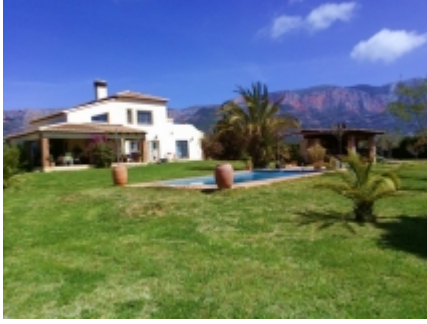
This lovely property & pool