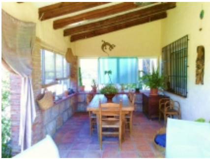
L-shaped naya off kitchen & living room