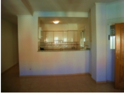
Living area looking through to kitchen