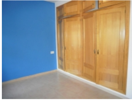
Bedroom with wardrobes!

CALIFICACIÓN ENERGÉTICA GLOBAL EMISIONES DE DIÓXIDO DE CARBONO [kgCO 2 /m 2 año]