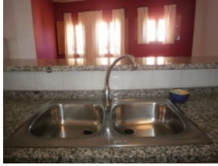
Kitchen to living area