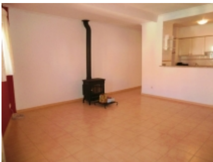
And again showing woodburner

Large living/dining room (views), American kitchen, full bathroom, double bedroom. Private roof terrace!