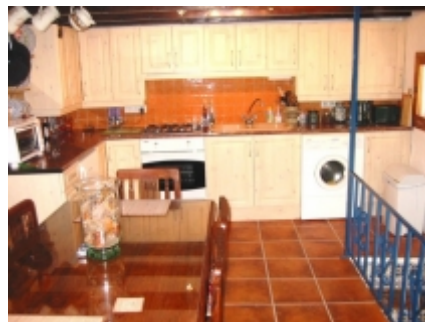
First floor kitchen/dining