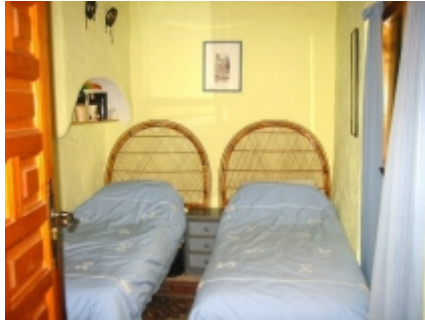
Second floor master bedroom

CALIFICACIÓN ENERGÉTICA GLOBAL EMISIONES DE DÍOXIDO DE CARBONO [kgCO 2 /m 2 año]