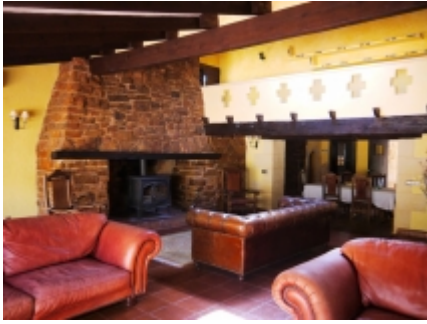
Huge living room