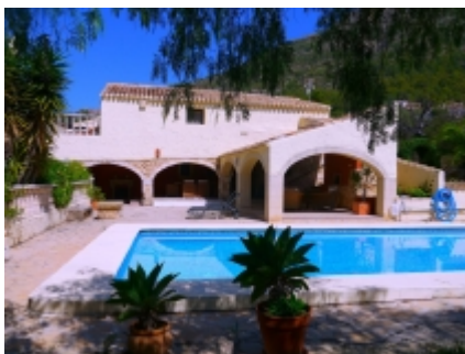
Pool & finca!

5 bedrooms, 6 bathrooms, living/dining, fab kitchen, breakfast area. Cul-de-sac location.