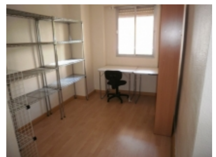
Study or second bedroom