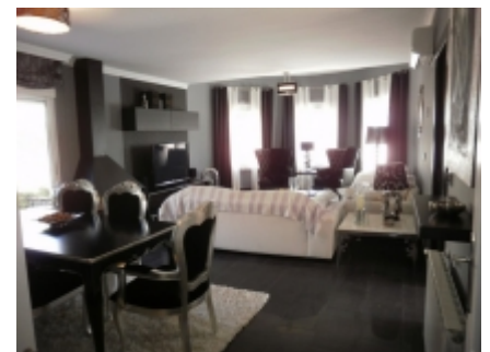
Sumptuous dining & living room