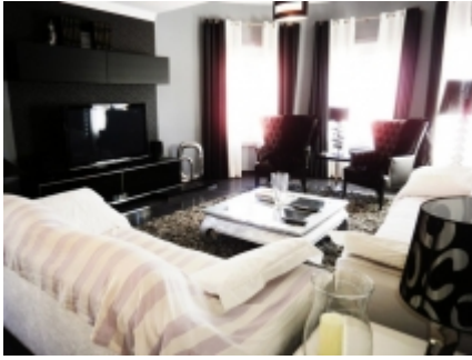
Living area again