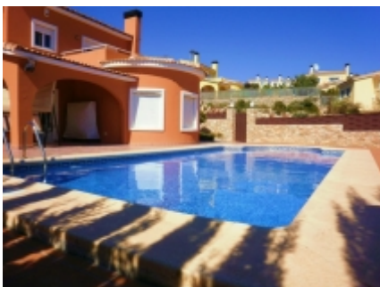
Pool & villa!

TRUE LUXURY. Designer house with 3 bedrooms, 2 bathrooms, guest wc, understairs store. Fabulous living/dining room, kitchen, utility, naya. Double car port with elec gates, walled gardens, irrigated & with lighting in flower beds, open terraces, 8 x 4 pool, outdoor shower. Sea views. UNDERBUILD.