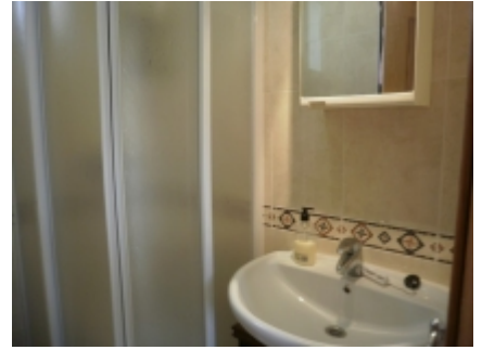
guest shower room