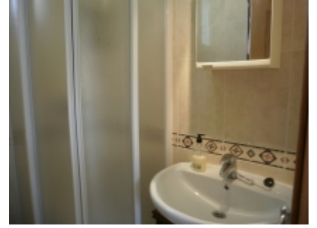
guest shower room