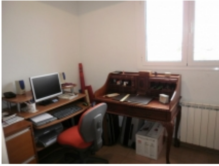
guest bedroom 2