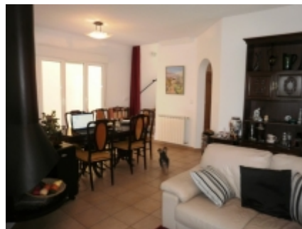
living to dining